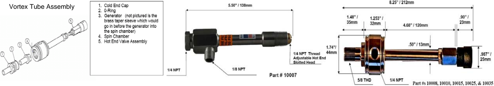
Vortex Tube Assembly